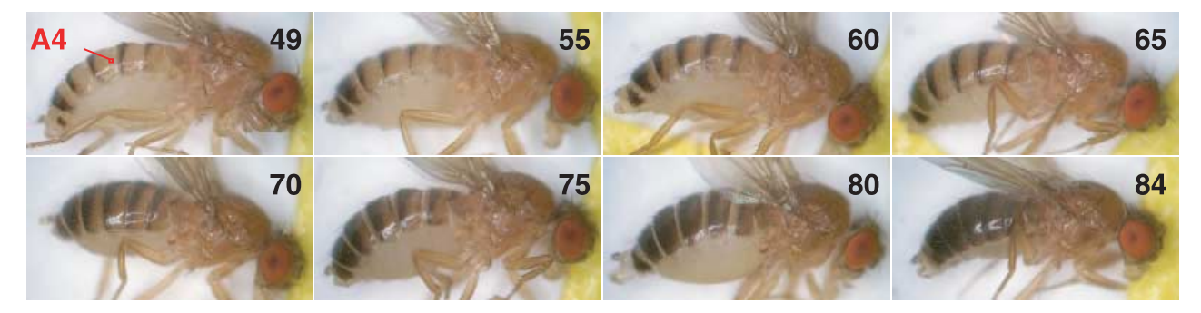
Fig. 1 The diversity of female abdominal pigmentation observed in isofemale lines of Drosophila melanogaster derived from natural populations. The upper left image depicts the specific location within the fourth abdominal segment where pigmentation was quantified (as greyscale darkness). Numbers ranging from 49 to 84 indicate the A4 pigmentation score of each fly shown.

balancer stock (TM6) homozygous for the recessive e^1 mutant allele of ebony . The pigmentation of offspring was measured as described above.