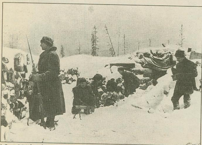
I Co., 339th Inf., 85th Div. in North Russia.