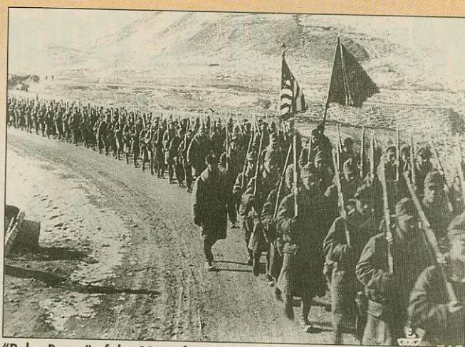
"Polar Bears" of the 31st Inf. Regt. on the march near Vladivostok in 1918.