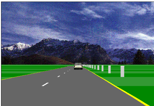
Winding road driven at 45 mi/hr

"Follow the vehicles as you normally would in real driving and read all signs."