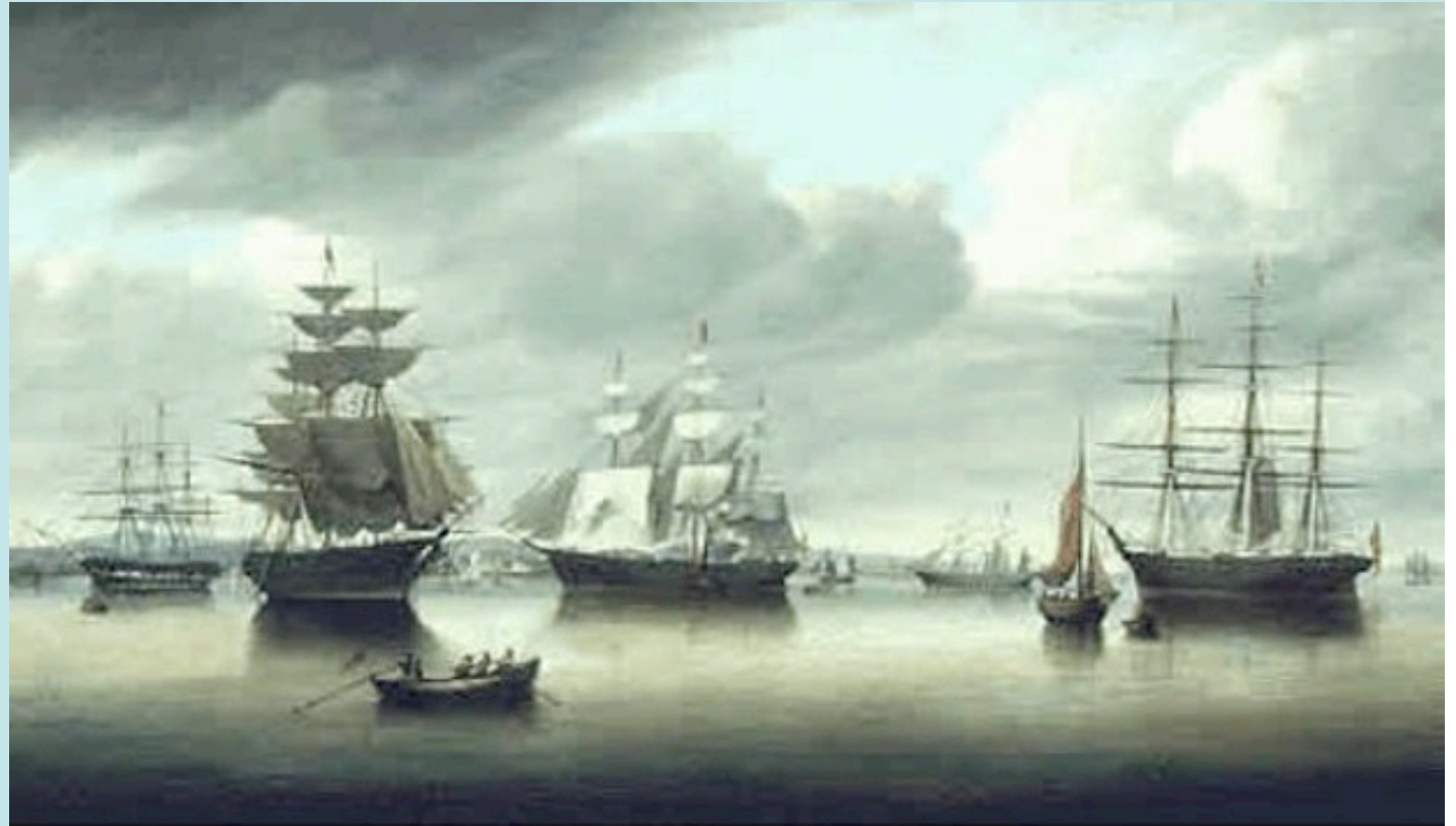
Opium Smuggling Clippers from the West.