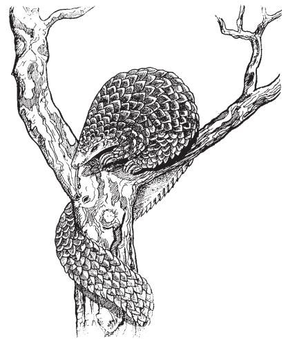
Manis tricuspis