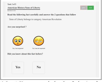
(c) Step 3: Users report whether they find a given fact surprising/not-surprising and whether they previously know about that fact.