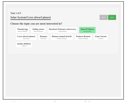
(a) Step 1: Users select a topic of their interest.