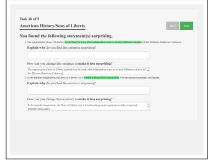
(f) Step 6: Users answer questions on how can they change the surprisingness of selected sentences.