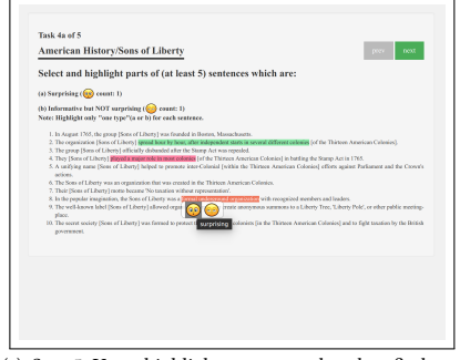
(e) Step 5: Users highlight sentences that they find surprising.