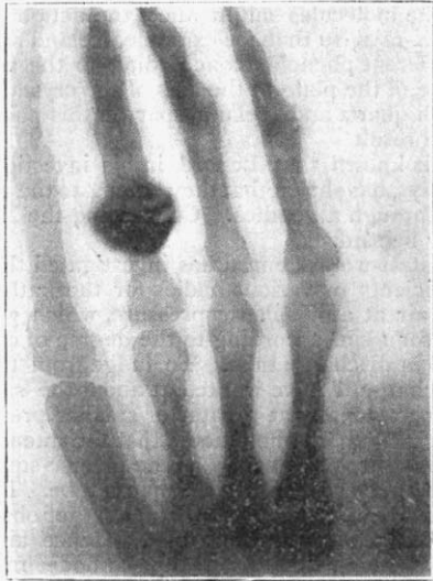
FIG. 1.—Photograph of the bones in the fingers of a living human hand. The third finger has a ring upon it.

I have observed and photographed many such shadow pictures. Thus, I have an outline of part of a door covered with lead paint; the image was produced by placing the discharge-tube on one side of the door, and the sensitive plate on the other. I have also a shadow of the bones of the hand (Fig. 1), of a wire wound upon a bobbin, of a set of weights in a box, of a