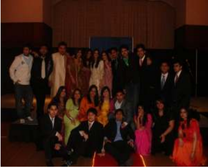
Above: Participants after the show