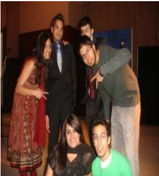
Above: The audio/video team