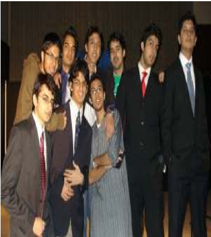
Above: The life of the show, this years freshmen class