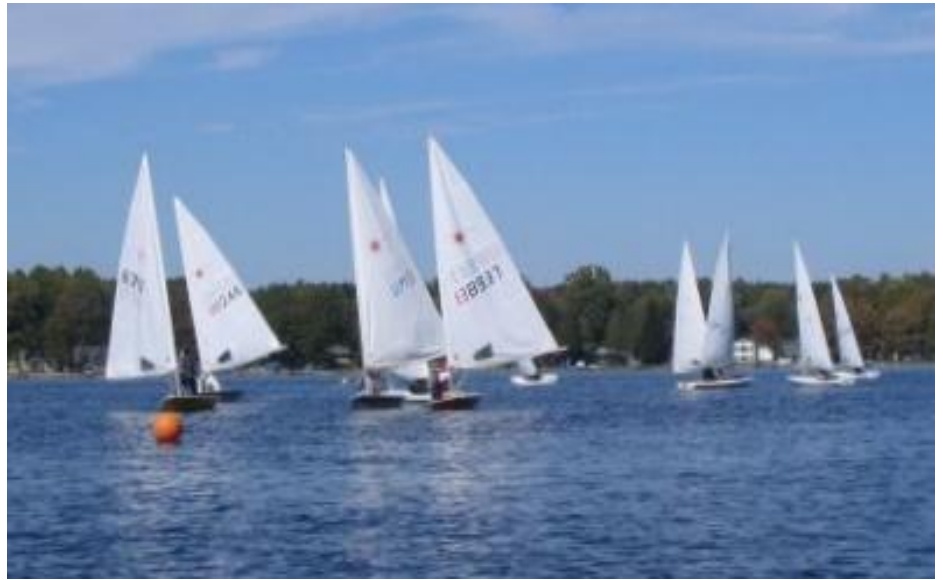
Laser Regatta: photo by Akiko Kamimura