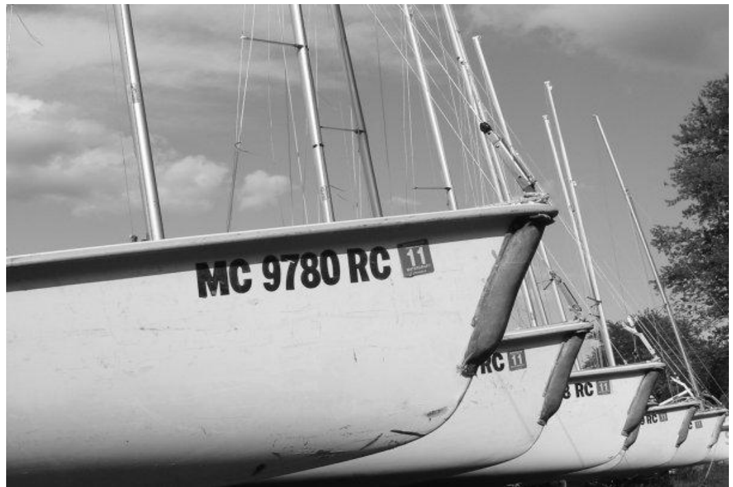
The Old Fleet