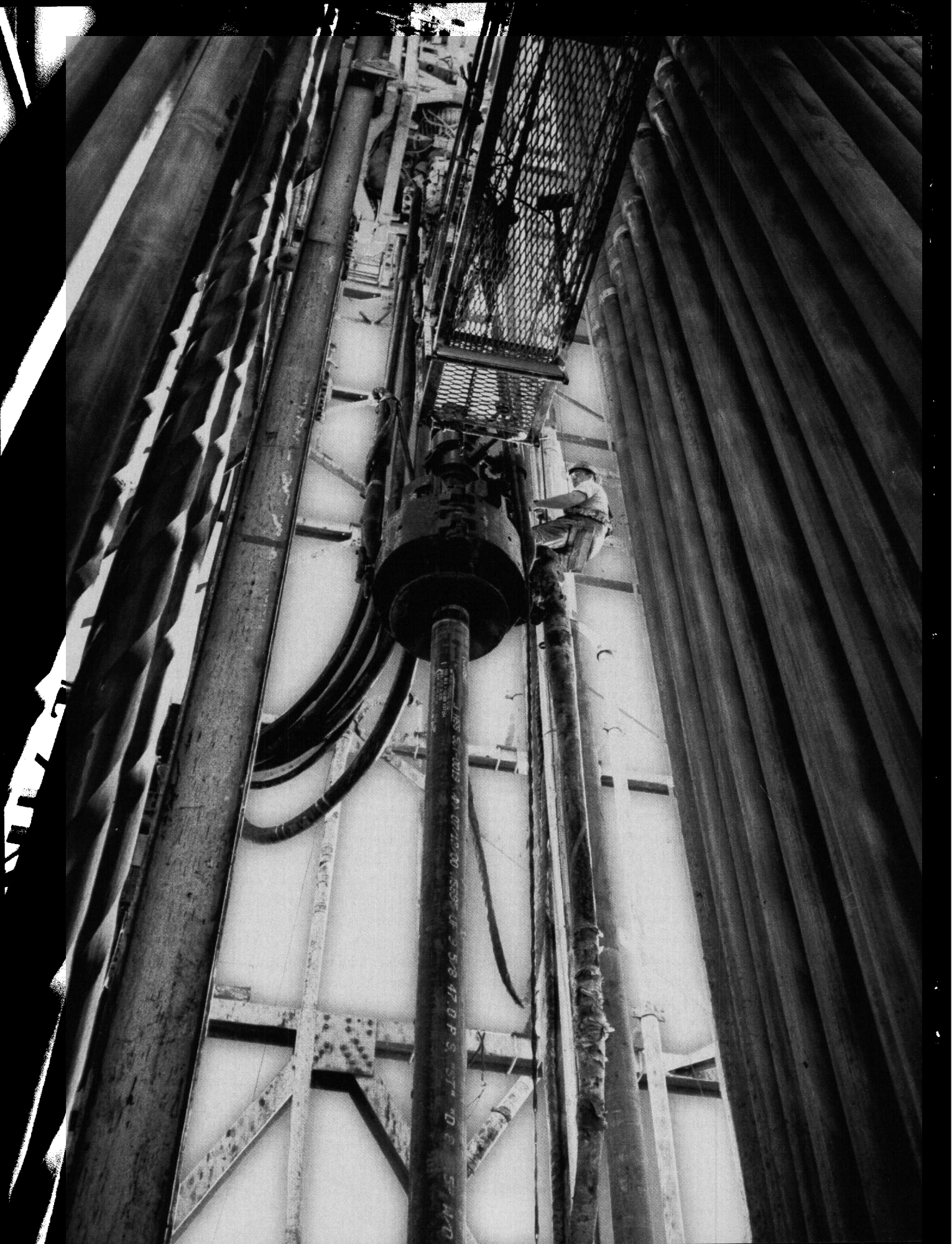
Reproduced with permission of the copyright owner. Further reproduction prohibited without permission.