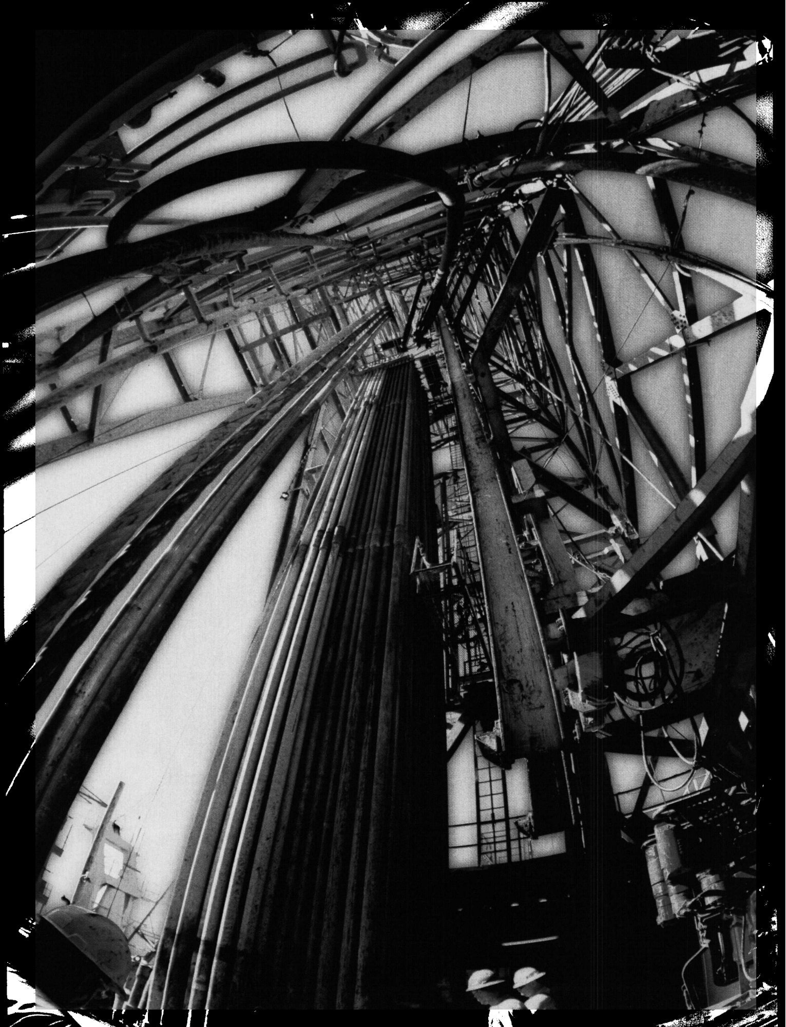
Reproduced with permission of the copyright owner. Further reproduction prohibited without permission.