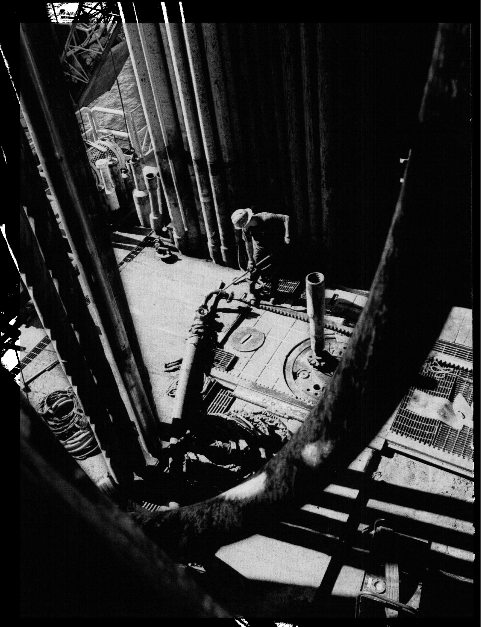
Reproduced with permission of the copyright owner. Further reproduction prohibited without permission.