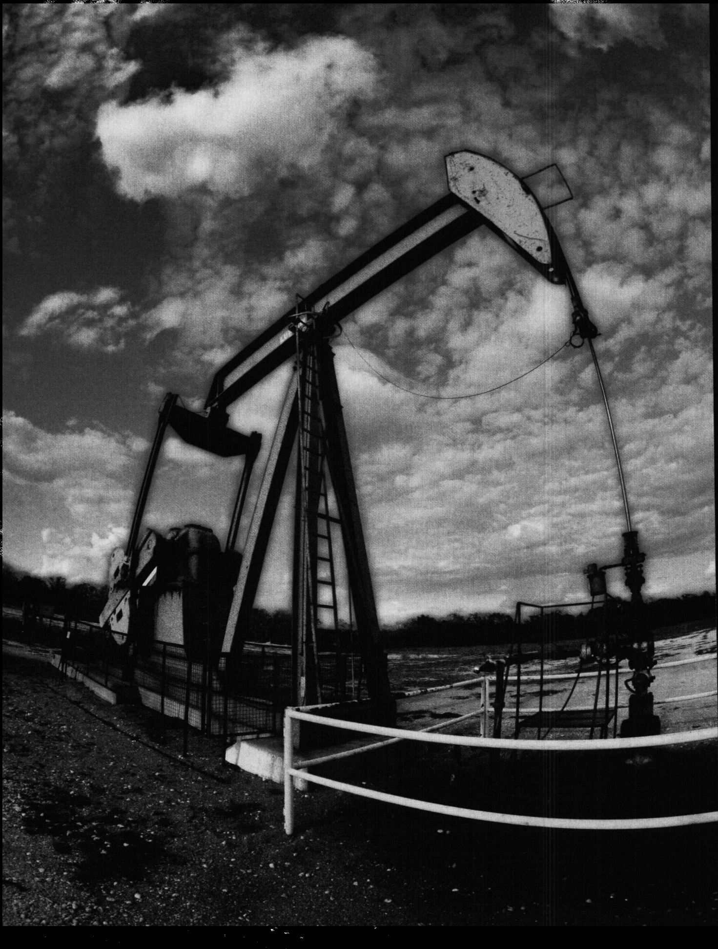
Reproduced with permission of the copyright owner. Further reproduction prohibited without permission.