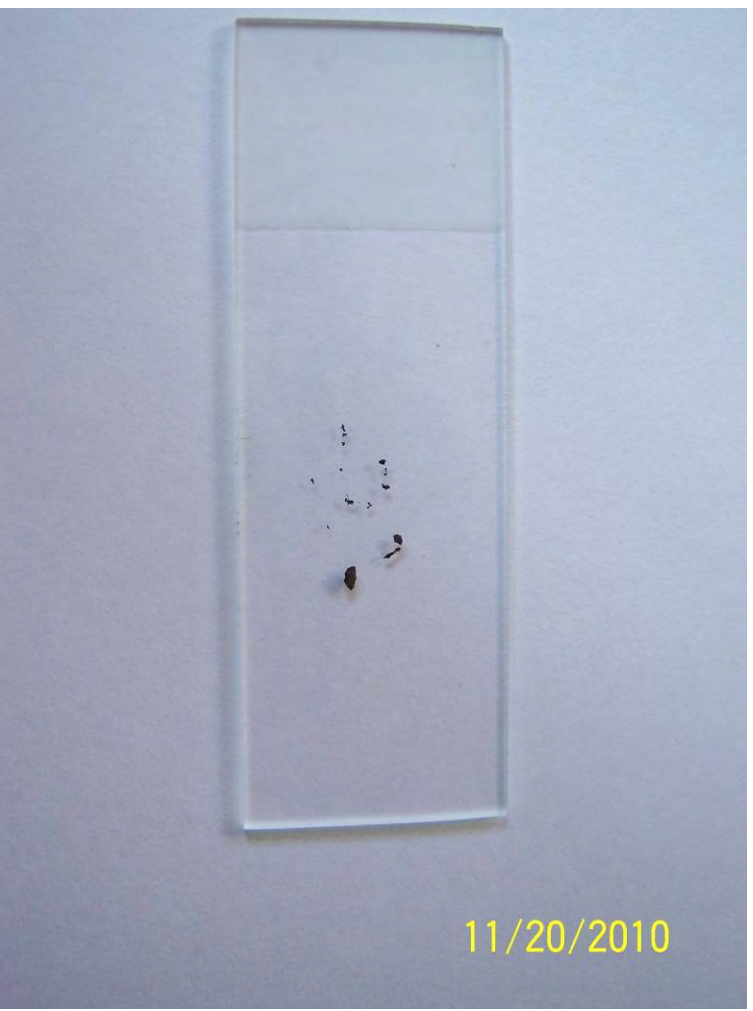
Step 7. We identified spherical objects about 5 to 30 µm in diameter. They were few and far between, perhaps 1% or less of the particles on the sticky notes.